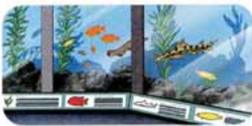
4. an exhibit