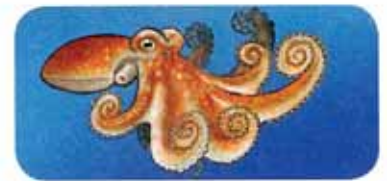
6. an octopus