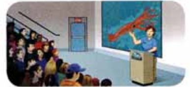
3. a lecture