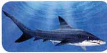
5. a shark