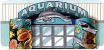
1. an aquarium