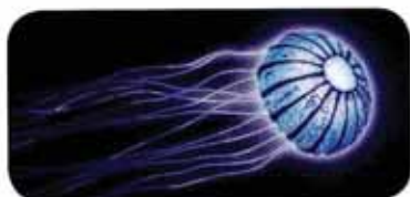
1. a jellyfish