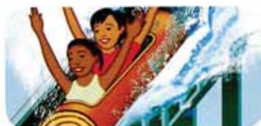
5. a ride