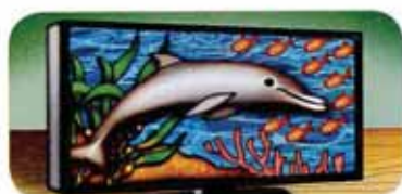
4. a video