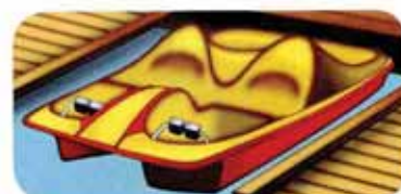
6. a pedal boat