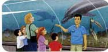
2. a tour