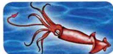
3. a squid