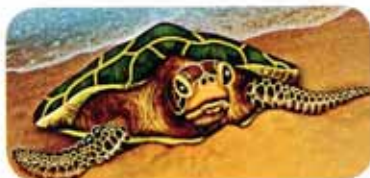
2. a sea turtle